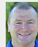
Graham Lowe Speaker for CFO Awards Gala Dinner Former CEO of the Manly Sea Eagles and rugby league icon